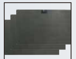
Breast special moving grid