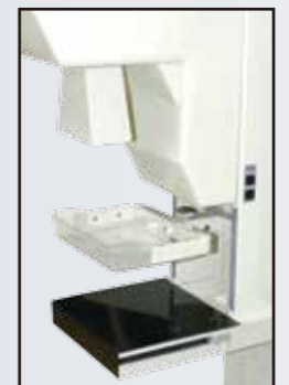
Side inserted cassette table