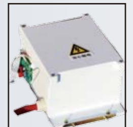
All solid-state high frequency and high voltage generator