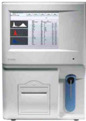
KT-6300 Auto Hematology Analyzer