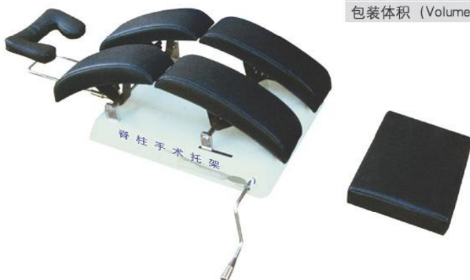
主要技术参数 (Main Technical Parameters)