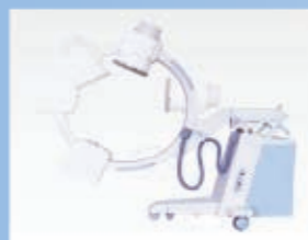
C-arm move along orbit 120^\circ ( +90^\circ \sim -30^\circ )