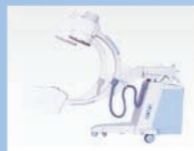
C-arm move backward and forward \geq 200\text{mm}