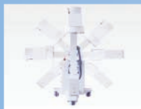
C-arm move around horizontal axis at \pm 180^\circ