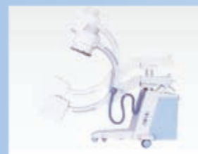
C-arm vertical movement \geq 400\text{mm}