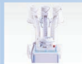
C-arm swing range at 30^\circ ( \pm 15^\circ )