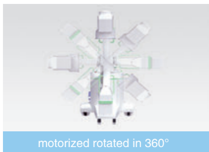
motorized rotated in 360°