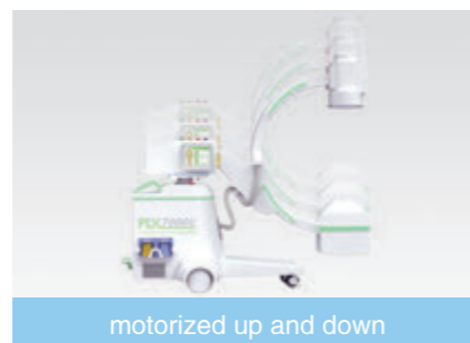
motorized up and down

※Four dimensional movement motorized movement for easy and accurate positioning.