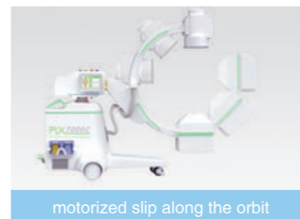
motorized slip along the orbit