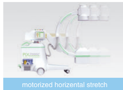
motorized horizontal stretch

※Four dimensional movement motorized movement for easy and accurate positioning.