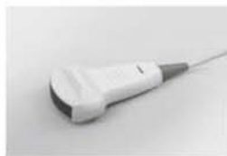
3.5MHz Convex Probe