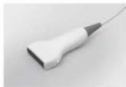
7.5MHz Linear Probe