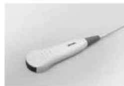
5.0MHz Micro-convex Probe