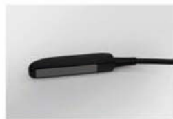
6.5MHz Vet rectal linear Probe